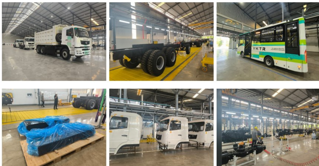
Exhibit 5. VKTS Factory